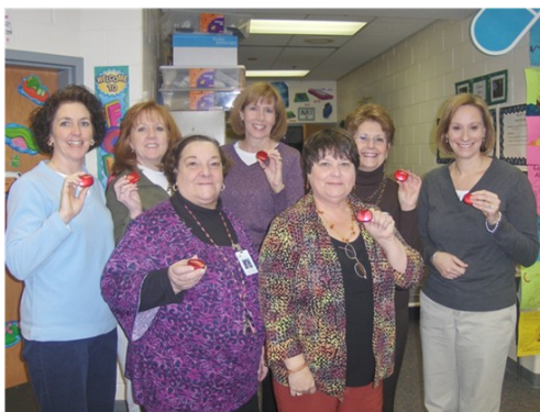
JRE staff use pedometers to "walk across the country"

In an effort to stay active and encourage increased movement awareness, the James River Elementary KidLink team purchased pedometers for the staff who participated in a walk across the country. All staff were encouraged to wear their pedometers, increase their daily steps, and record their mileage. In just one month, they had walked from Williamsburg, Virginia to San Diego, California and they spent the rest of the school year walking to other exciting destinations.