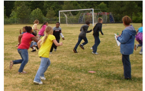
Stonehouse students ROCK the test!

Stonehouse Elementary teachers used some of the SHIP Wellness Integration lessons for science and history during their Rock the Test program for SOL preparation. This was a great way to prepare for testing, because it engaged the students in a different style of learning and kept their minds and bodies energized and focused!