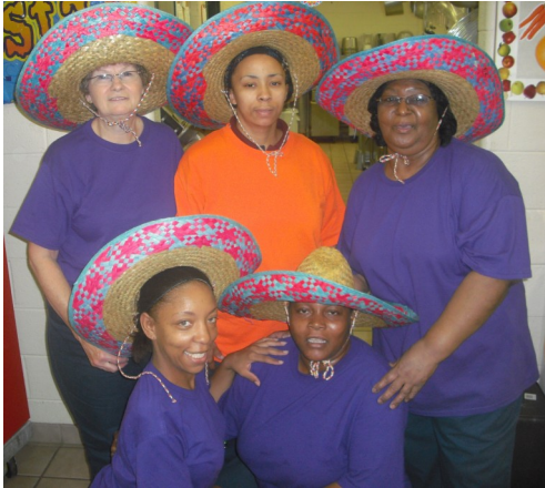
DJ CNS Staff celebrate Cinco De Mayo

The Child Nutrition Services staff at DJ Montague Elementary planned a fun Cinco De Mayo celebration with costumes and decorations to accompany the special menu that day. Students enjoyed the healthy options and the added fun in the cafeteria!